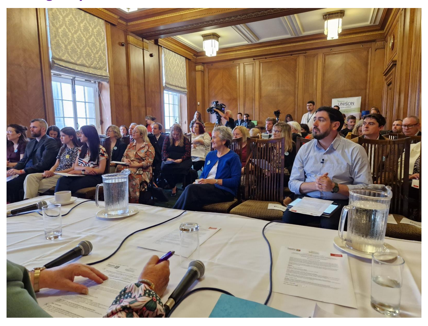
The event was at full capacity on the day.